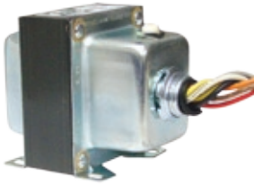
Functional Devices, Inc. A600C 2005