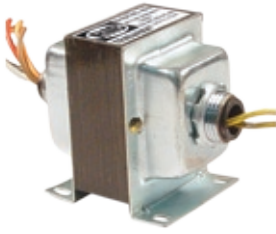
Functional Devices, Inc. A600C 2005