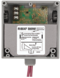
Functional Devices, Inc. A600C 2005