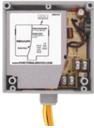
Functional Devices, Inc. A600C 2005