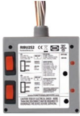
Functional Devices, Inc. A600C 2005