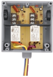
Functional Devices, Inc. A600C 2005