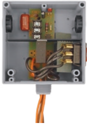
Functional Devices, Inc. A600C 2005