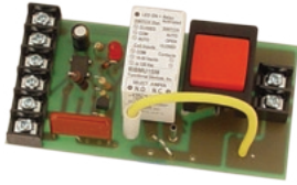
Functional Devices, Inc. A600C 2005