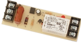
Functional Devices, Inc. A600C 2005