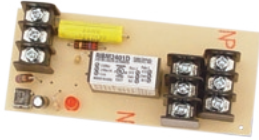
Functional Devices, Inc. A600C 2005