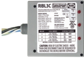
Functional Devices, Inc. A600C 2005