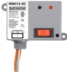
Functional Devices, Inc. A600C 2005