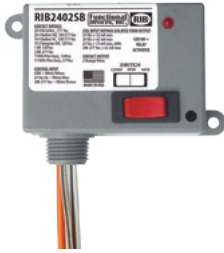
Functional Devices, Inc. A600C 2005