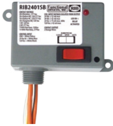
Functional Devices, Inc. A600C 2005