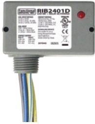
Functional Devices, Inc. A600C 2005