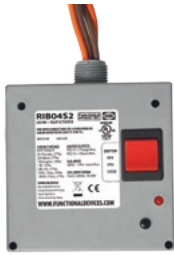
Functional Devices, Inc. A600C 2005