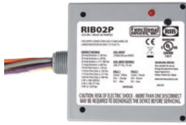
Functional Devices, Inc. A600C 2005