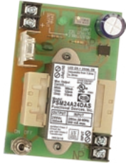
Functional Devices, Inc. A600C 2005