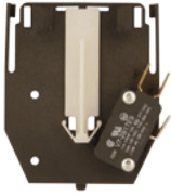
Functional Devices, Inc. A600C 2005

For Use With: CN24A3C30, CN24A3C40 CN01A3C30, CN01A3C40 CN02A3C30, CN02A3C40